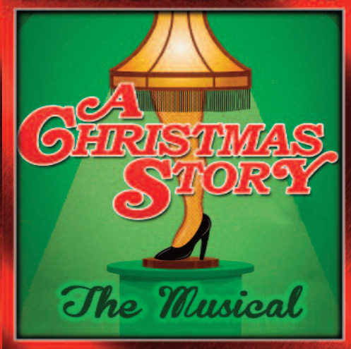
NOVEMBER 9-11 & 16-18, 2018