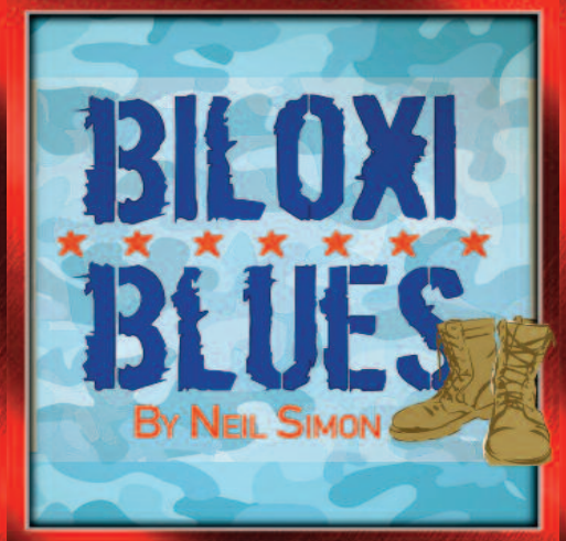
APRIL 5-7 & 12-14, 2019