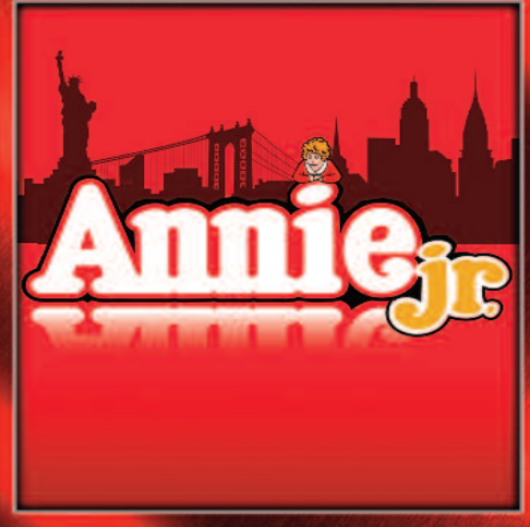
MAY 30-31 - JUNE 1-2, 2019